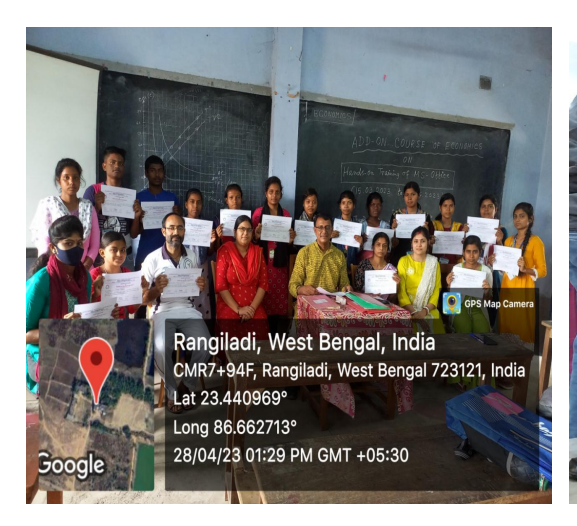
(Research Methodology on SPSS)