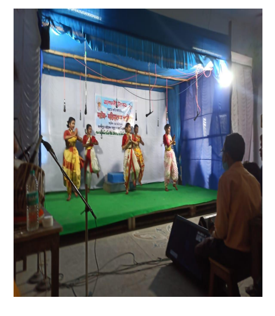
(Presentation on Devi Durga: Mahisasuramardini)