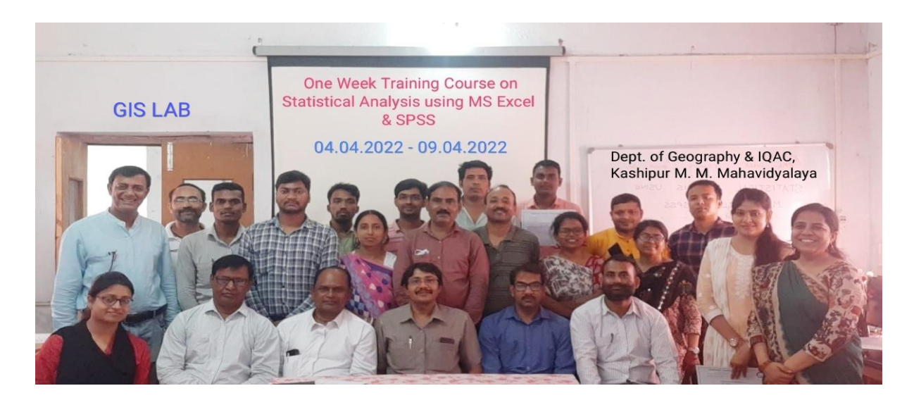
(Training Program on Research Methodology by the Department of Geography)