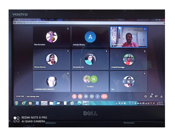
(Webinar on IPR)